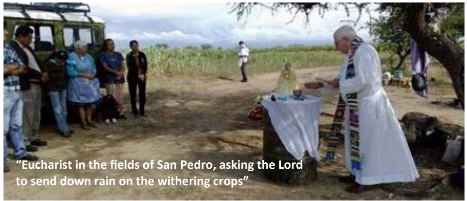
"Eucharist in the fields of San Pedro, asking the Lord to send down rain on the withering crops"