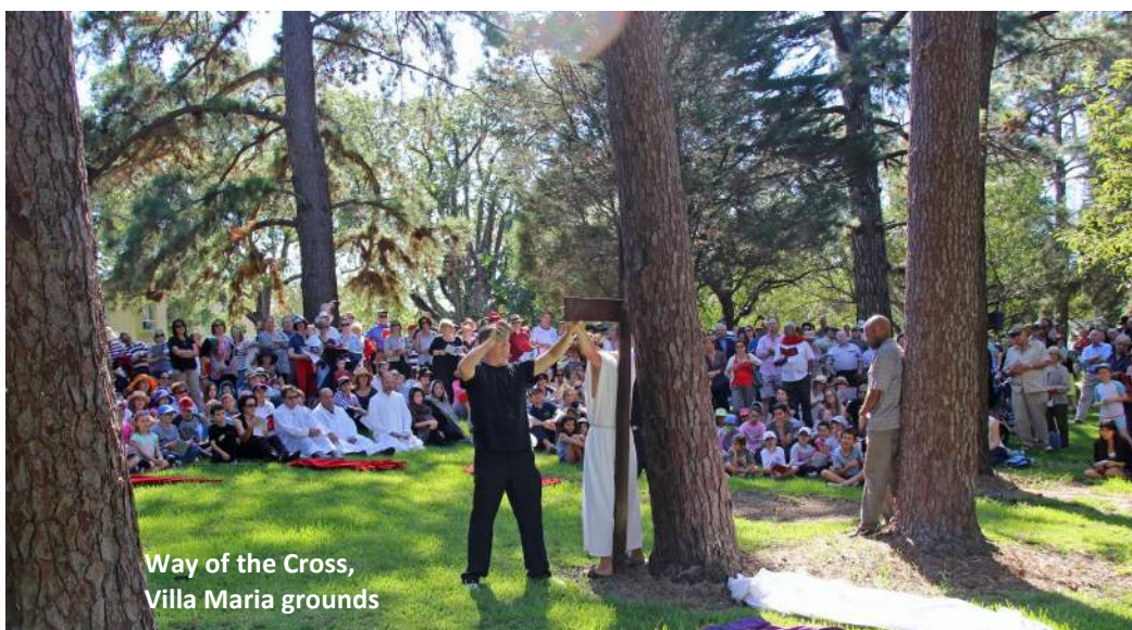
Way of the Cross, Villa Maria grounds