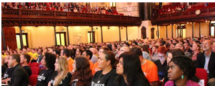
Above: Marists from all branches were represented at the Sydney Alliance's 'March Assembly' at Sydney Town Hall.