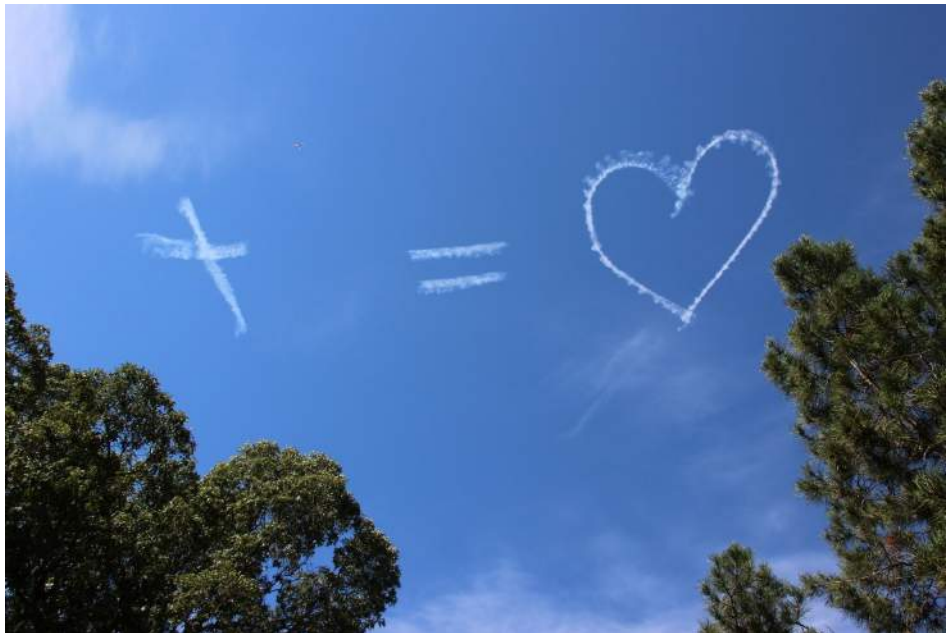
Good Friday, over Hunters Hill. "We can reflect on and recall God's love for us individually and as a Province over and over and over"

and see salvation history as a journey forward ending ultimately in the fulfilment of God's plan, we miss something. Going forward, progressing, seems to be quite basic to our core and that is good when we are growing, expanding, and see our achievements come about.